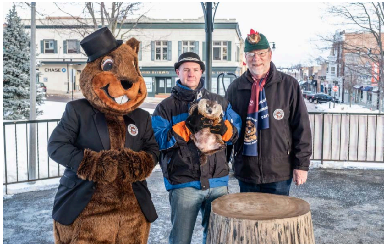
When Woodstock Willie comes out of his tree trunk home on Feb. 2, I hope he sees a lot of unclaimed property that's been claimed by Illinoisans. Woodstock, Illinois, hosts Groundhog Days every year in honor of the famous Bill Murray movie.

Today around 77% of people get their money through FastTrack or Money Match.