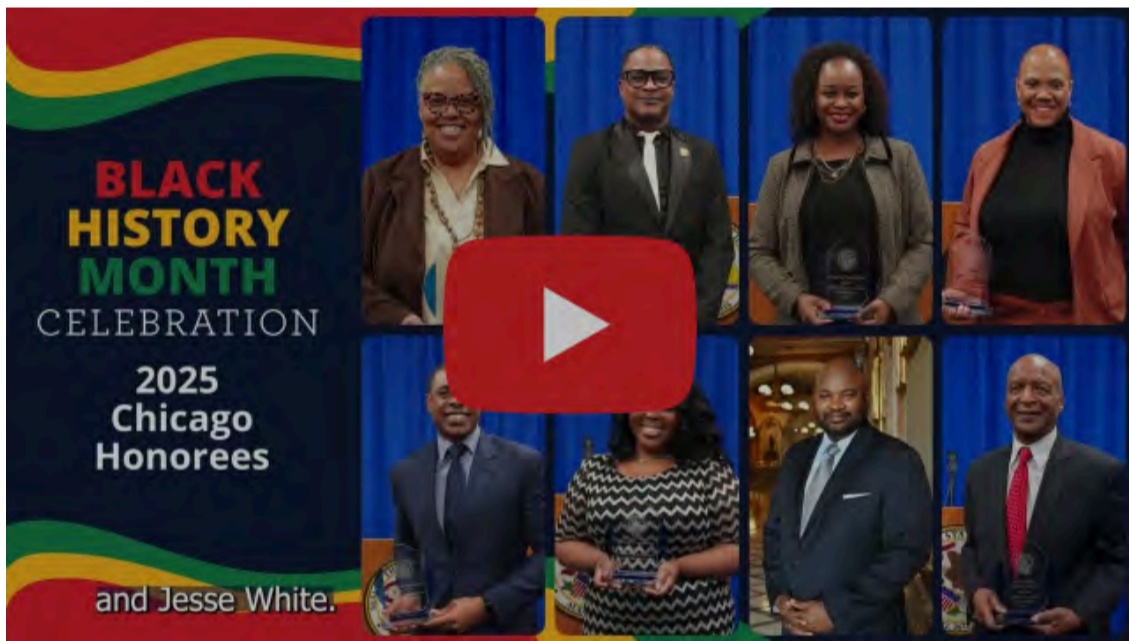
February is Black History Month, and I am proud that my office celebrates and recognizes the successes of African Americans in many fields. Watch this video of our celebration in Chicago!

Black History is Illinois history. Last week in Chicago, I was honored to celebrate these eight leaders who make our state a better place: