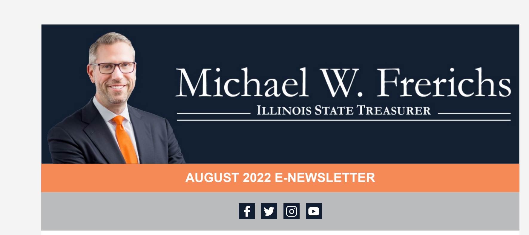
Treasurer's Note Enjoy the Fair And Join Me at the Auction